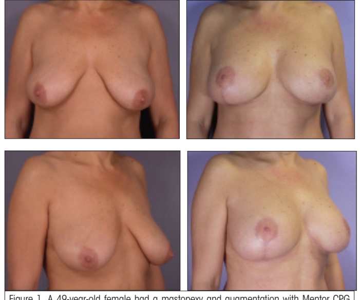
Figure 1. A 49-year-old female had a mastopexy and augmentation with Mentor CPG implants -- that is, submuscular placement -- and went from a 36C to 36D.

questions when they meet with me regarding breast augmentation surgery. Clearly, they want to not only look good, but to feel good; and they are concerned about their underlying health. The most important thing that I'm concerned about is their health and safety.